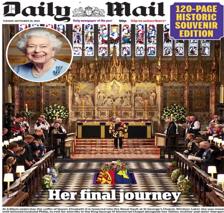
At 4.50pm yesterday the coffin of Queen Elizabeth II is lowered into the Royal Vault at St George's Chapel, Windsor. Later she was moved, with beloved husband Philip, to rest for eternity in the King George VI Memorial Chapel alongside her father, mother and sister Margaret