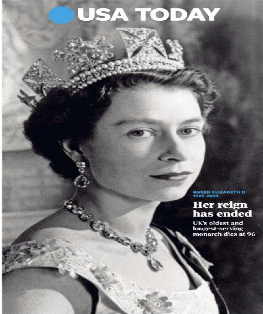
Queen Elizabeth II wears some of the crown jewels for a portrait in 1954, two years after ascending to the throne of the United Kingdom.

SPECIAL SECTION ON QUEEN ELIZABETH INSIDE